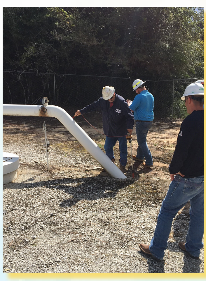
GPS Staff conducts a Cathodic Protection (CP) field check to insure the prevention of corrosion cells

and knowledge levels, GPS sponsored training by hosting the 29th Annual Gas Pipeline Safety Seminar in November 2016. Topics for this seminar, presented by GPS personnel, vendors and operators, covered updates to federal guidelines and the Minimum Federal Safety Standards that GPS enforces. Over 300 natural gas and hazardous liquid system operators were in attendance. There were over 40 vendors attending that displayed and demonstrated equipment to be used in natural gas and hazardous liquid applications. GPS also co-hosted the Pipeline Safety Conference that was conducted in New Orleans, Louisiana in July 2017. The topics for this seminar, presented by instructors from the PHMSA Training & Qualification (TQ) Center in Oklahoma City, Oklahoma, vendors, operators, and state regulators covered updates to federal guidelines and the Minimum Federal Safety Standards for natural gas and hazardous liquids. Over 500 natural gas and hazardous liquid operators attended the conference. More than 50 vendors set up displays and demonstrated the most modern equipment used in the natural gas and hazardous liquids industry. In addition to Alabama's GPS personnel,