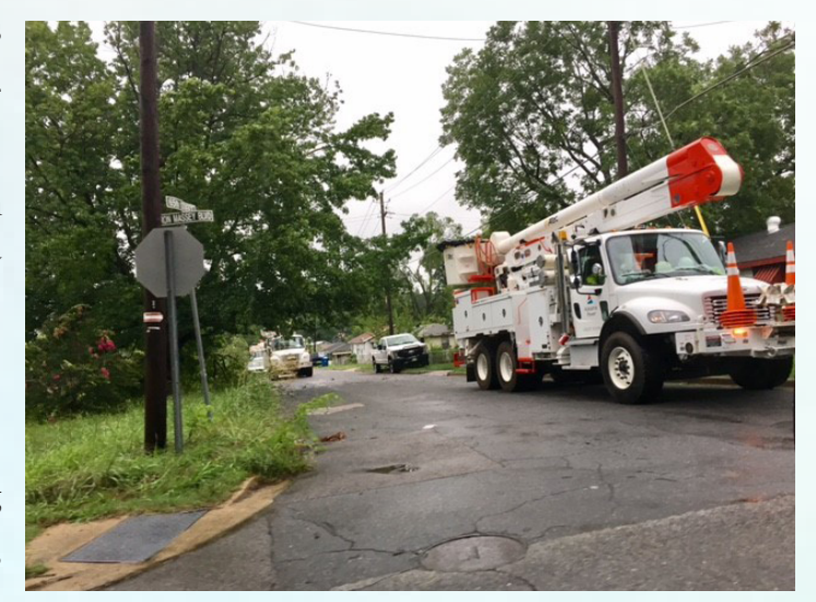
Repairs being made by Alabama Power to electrical system damage from an EF-1 tornado in June 2017 that struck a small city just west of Birmingham.

The Rates and Services staff receives and maintains and activities consisted of a wide variety of regulatory overmotor carrier annual reports that are required to be filed sight but slowed slightly to a steady pace due to the loss of by April 30 of each year covering the previous calendar telecommunications Universal Service Fund reviews. The year of operation. The staff also handles requests for Field Services Section continued to perform field inspec-