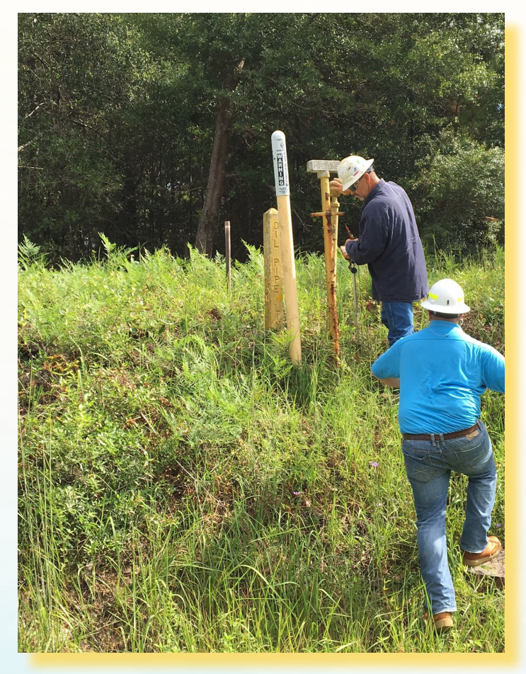
GPS Staff conducts corrosion protection readings on a steel transmission main.

In August 2016 the Director of GPS and others from the One-Call Commission met with representatives of PHMSA to discuss Alabama's adequacy regarding damage prevention. This is a recurring examination of the state's damage prevention efforts that will be conducted by PHMSA each year. The result of the FY-2016 examination was a failing grade for Alabama due to the fact that