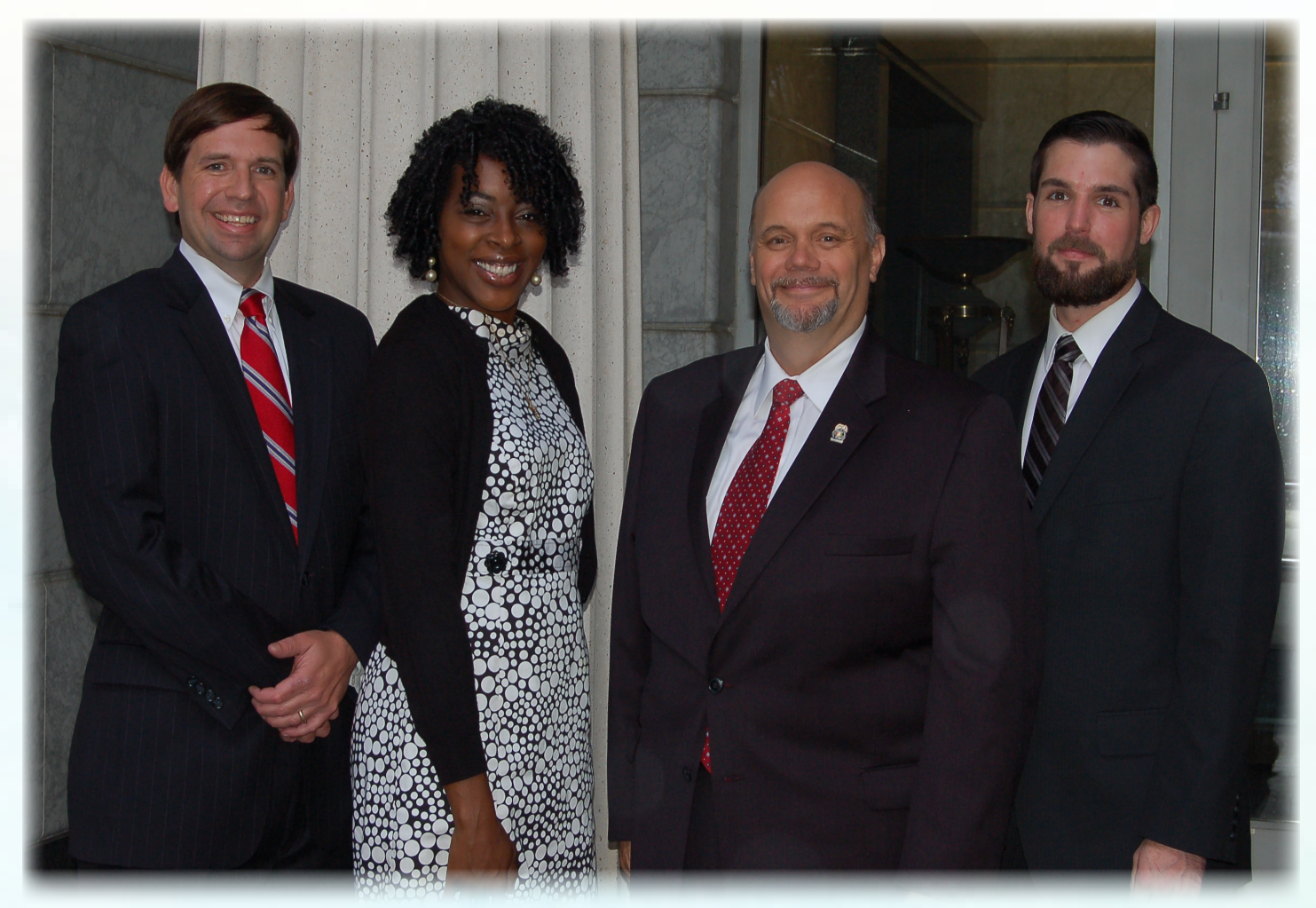
COMMISSIONER JEREMY H. ODEN'S STAFF

On a State level, Commissioner Oden was highly involved in electricity generation and load growth issues, alternative energy use, gas pipeline safety, railway safety, transportation regulation, intra-state port issues, rural broadband development, and large economic development projects. Commissioner Oden held local meetings, spoke at conferences, and met with local businesses and industries to update them on the regulatory issues in our State.